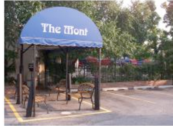
The Mont (enjoy the patio!!) 1300 Classen Blvd. O'Connell's Irish Pub, Asp

St. - pregame, postgame hangout Seven 47 , 747 Asp Ave., Campus Corner, good sandwiches, cocktails Sweet Basil, 211 W. Main St. – great Thai T.E.A Café, 1241 Alameda – great Korean/Asian food, bubble tea Turquoise American Bistro, 786 Asp Ave., Campus Corner Van's Pig Stand , 720 N. Porter Ave. – great barbecue Winan's Fine Chocolates and Coffees , 207 E. Main St., downtown