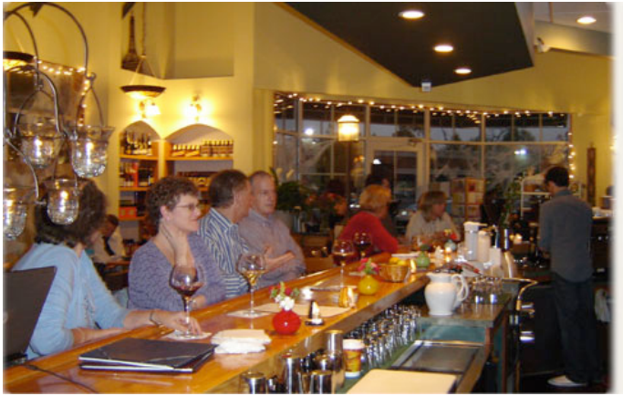
Legend's Restaurant , 1313 W. Lindsey St. Misal of India, 580 Ed Noble Parkway